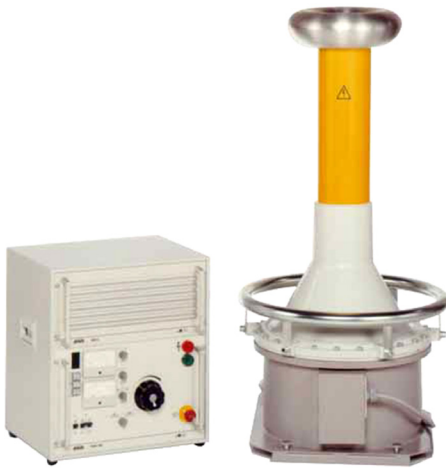
The figure is illustrative.